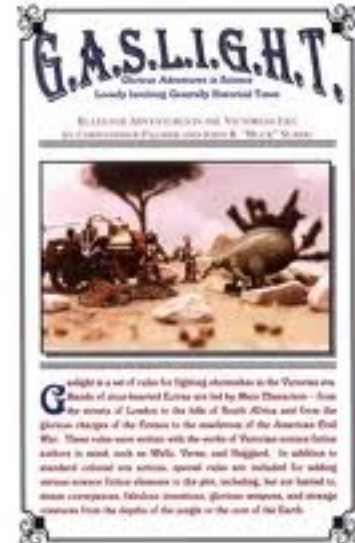
Figure 1: GASLIGHT uses a card-based activation system in which each unit has its own card in the deck.

Both sources of randomness are important. Each turn the six-sided dice are re-rolled. Without rerolling these dice each turn, players could predict which units will move